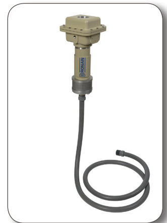
X96SI/R Transmitter with FlexDetector™

Ronan's new X96SI/R Transmitter is compatible with all Ronan scintillation detectors. The X96SI/R can be integrally-mounted in an explosion-proof housing or remotely mounted in the field or control room. The system is fully Ethernet capable allowing configurations, software updates, and data logging to be completed easily through the user's PC using a standard web browser. Built-in intelligence provides a range of features including automatic compensation for vapor density changes, foam, gasses, and process build-up; automatic source decay compensation; auto calibration; radiation discrimination; state of the art dynamic tracking of process fluctuations; data logging and event recording; adjustable time constant; and empty vessel alarm.