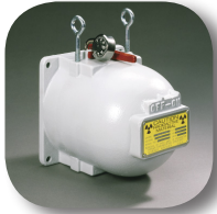
SA-1 Source Holder

The SA-1 and SA-8 general purpose Source Holders are suitable for a wide range of applications requiring an externally mounted source. These source holders accommodate higher source activity while providing shielding which meets all international standards for radiation limits. The SA-1 and SA-8 contain a rotary shutter with the option to include a remote actuated shutter with shutter position indicator.